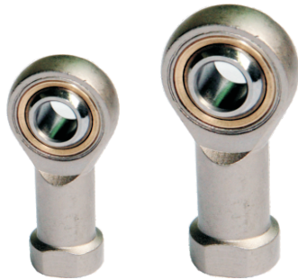
Table for universal joint and cylinder