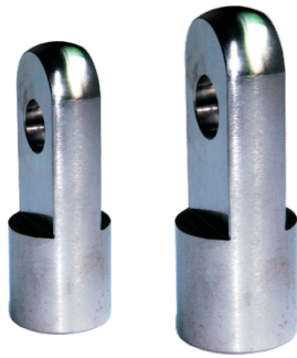
Table for I knuckle and cylinder